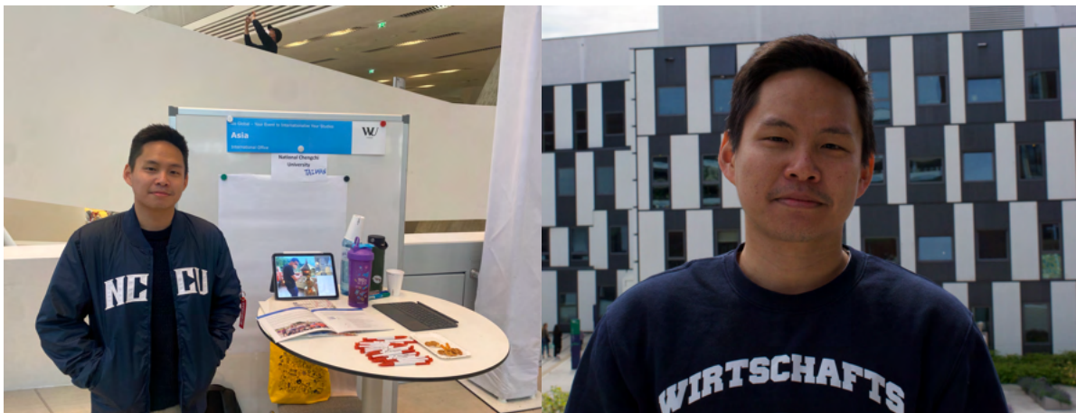
WU Go Global Day