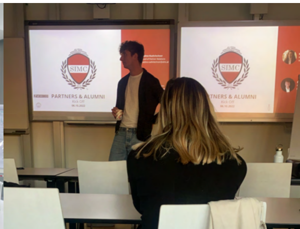
Partners & Alumni Info Session