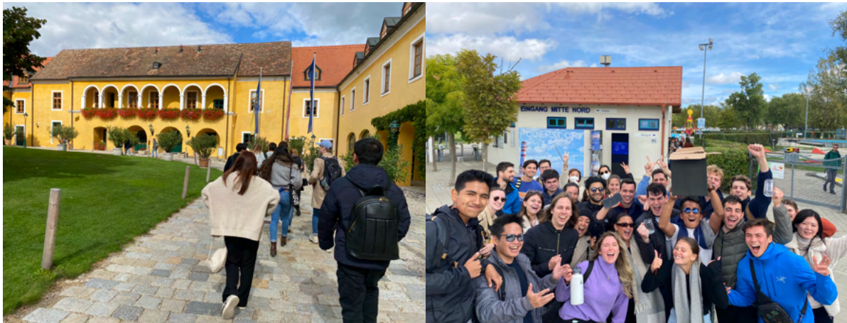
Visit Wine Cellar

During the two-week Orientation and Cultural Program, there is a day each week where students can take transportation arranged by the school to visit wine cellar and historical